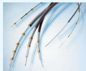
> COAXIAL CABLE