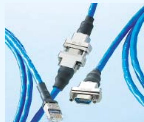
> HIGH SPEED 10 Gb/s LINK