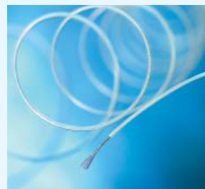
> ALVEOLAR COAXIAL CABLE

CELLOFLON® membranes are used to manufacture very complex shapes with special patented process.