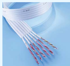
> FLEXIBLE COMPOSITE CABLE